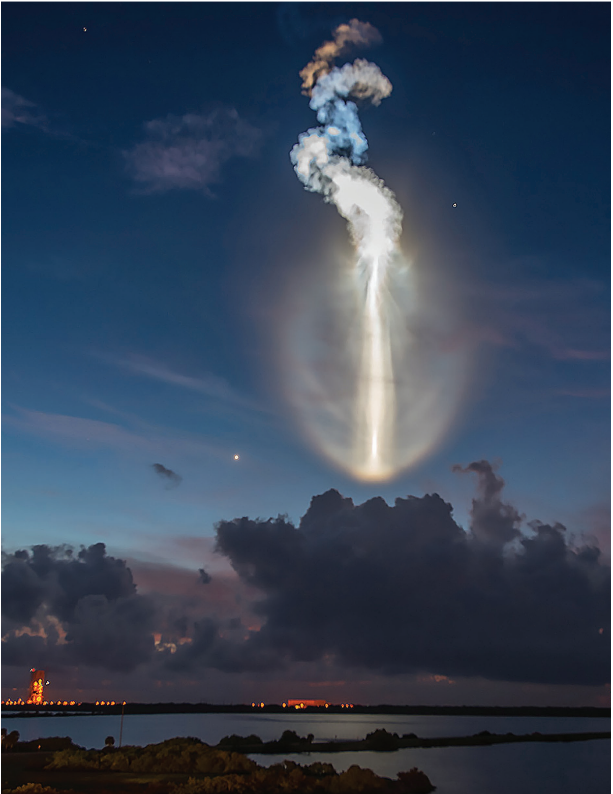
Above: An Atlas V rocket carrying the fourth Mobile User Objective System (MUOS) satellite launches from Cape Canaveral Air Force Station, Florida on September 2, 2015.