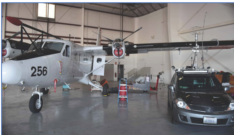
Figure 2: Twin Otter airplane and AMOG Surveyor used in the COMEX campaign. The AMOG Surveyor makes mobile measurements of meteorology and atmospheric trace gases, including methane, under COMEX flights.

Roy. Soc. A, 369(1943), 2058-2072. http://dx.doi.org/10.1098/rsta.2010.0341 .