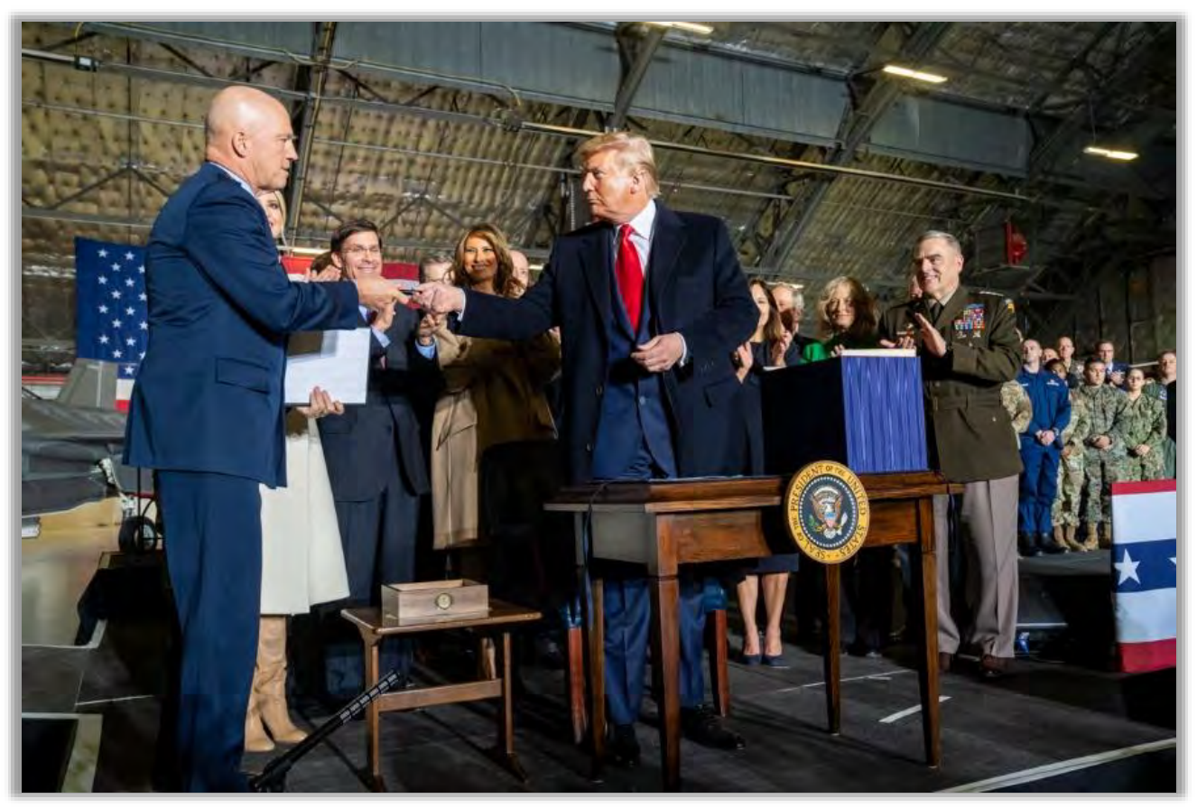
President Donald J. Trump greets General John W. "Jay" Raymond after signing the 2020 National Defense Authorization Act establishing the United States Space Force at Hangar 6 at Joint Base Andrews on December 20, 2019.