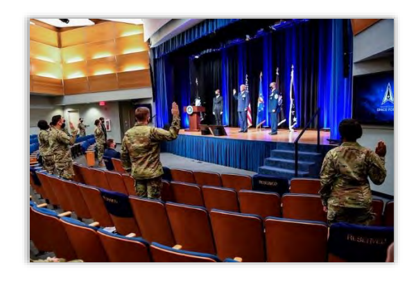
Chief of Space Operations Gen. John W. Raymond administers the oath of office to airmen transferring into the U.S. Space Force during a ceremony at the Pentagon on September 15, 2020.

On February 12, 2020, the President issued an Executive Order on Strengthening National Resilience through Responsible Use of Positioning, Navigation, and Timing Services. This order seeks to protect the national and economic security of the United States and its partners by ensuring reliable and efficient function of the Global Positioning System (GPS) and related critical infrastructure. The United States continues to make GPS services available worldwide as a free service, which has offered immense global value for communications, security, commerce, agriculture, transportation, mobility, weather, response. and emergency However, dependence on this invisible utility and its widespread adoption require protection from disruption and manipulation to ensure national resilience.