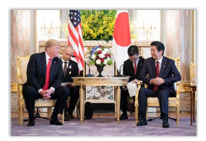
President Donald J. Trump participates in an expanded bilateral meeting with Japan's Prime Minister Shinzo Abe Monday at the Akasaka Palace in Tokyo on May 27, 2019.

On May 27, 2019, as part of the Japan-U.S. Summit in Tokyo, Prime Minister Shinzo Abe and President Donald J. Trump agreed to dramatically expand U.S.-Japan cooperation in human space exploration through the U.S.-led Artemis Program. The agreement was the culmination of years of increased cooperation between the United States and Japan in space science, space security, commercial space, and human spaceflight. On November 15, 2020, Japanese astronaut Soichi Noguchi became the member first international of NASA's Commercial Crew Program when he launched with American astronauts from Kennedy Space Center. On December 15, 2020, the United States and Japan signed an agreement to launch one hosted payload on Japan's Quasi-Zenith Satellite System. Finally, on December 28, 2020, the United States and Japan signed an agreement for cooperation on the Artemis Gateway.