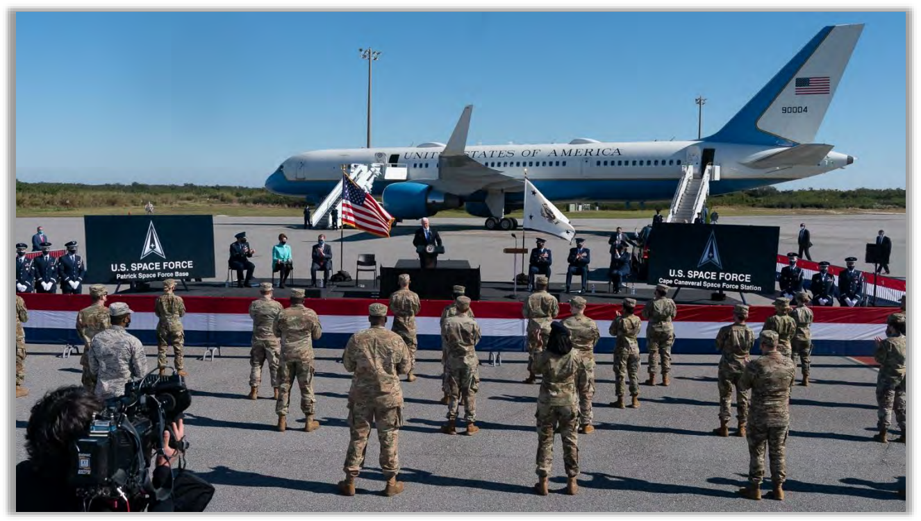
Vice President Mike Pence delivers remarks at a ceremony to re-designate existing U.S. Air Force installations as the first two installations of the United States Space Force at Cape Canaveral Space Force Station on December 9, 2020.

In standing up the newest Armed Service, the U.S. Space Force has achieved a number of significant milestones at a rapid pace: