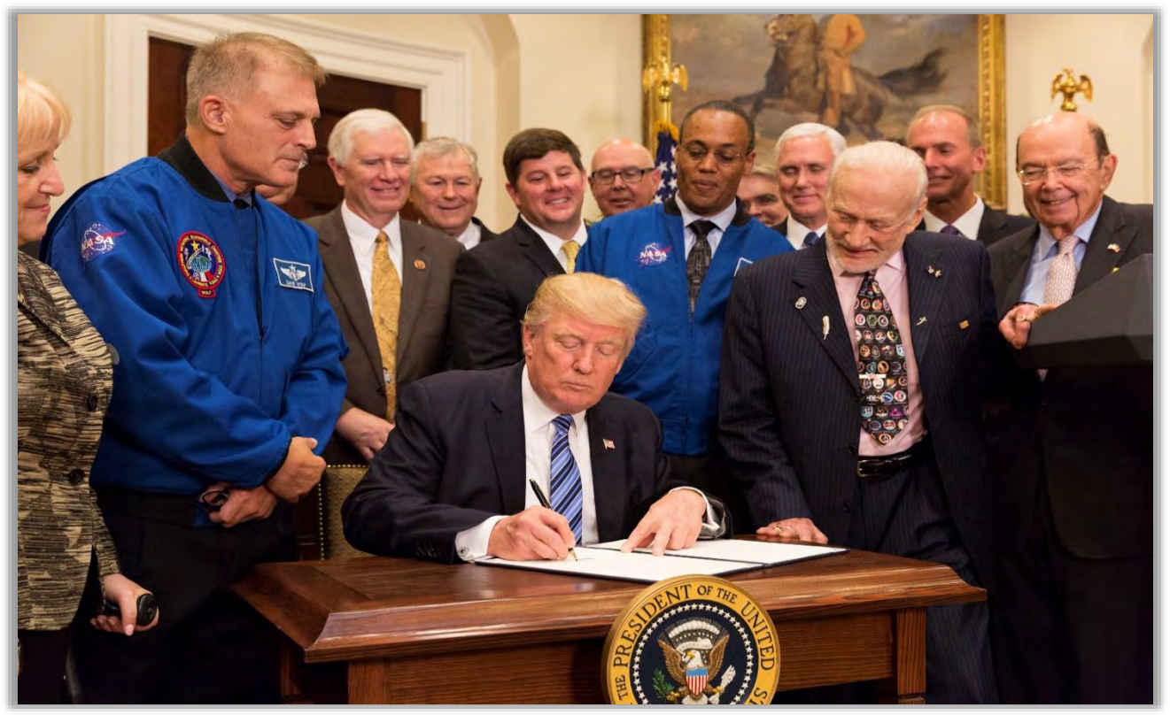
President Donald J. Trump signs Executive Order 13803, Reviving the National Space Council in the Roosevelt Room of the White House on June 30, 2017.