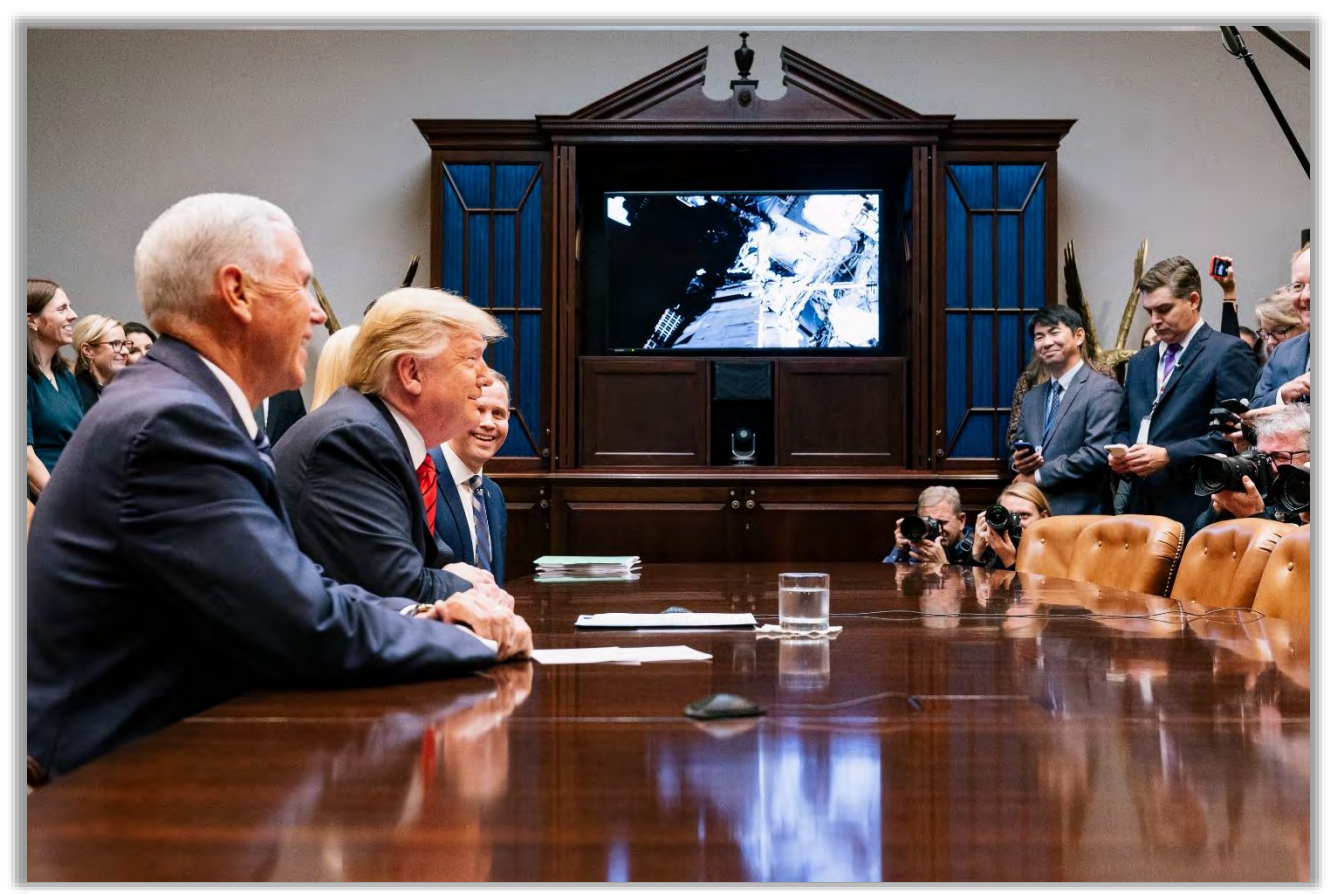
President Donald J. Trump speaks with NASA astronauts Christian Koch and Jessica Meir via satellite uplink during the first ever all-female spacewalk in the Roosevelt Room of the White House on October 18, 2019.

released the <u>National Strategy for Planetary</u> <u>Protection</u>. The strategy guides implementation of direction from the National Space Policy to develop objectives related to planetary protection in a manner that balances the Nation's interests in safety, scientific discovery, human exploration, and commercial activity in space.