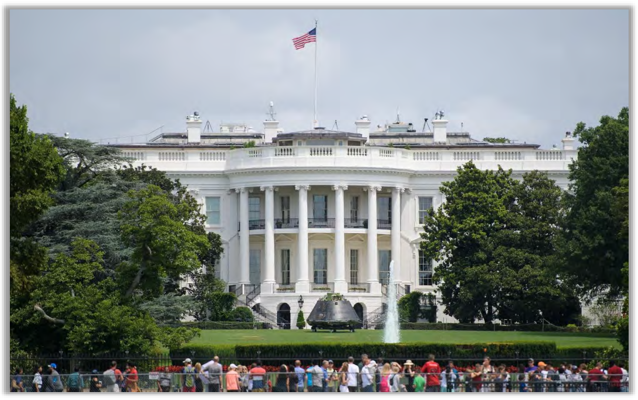
NASA's Orion spacecraft, produced by prime contractor Lockheed Martin, is seen on the South Lawn of the White House on July 22, 2018.