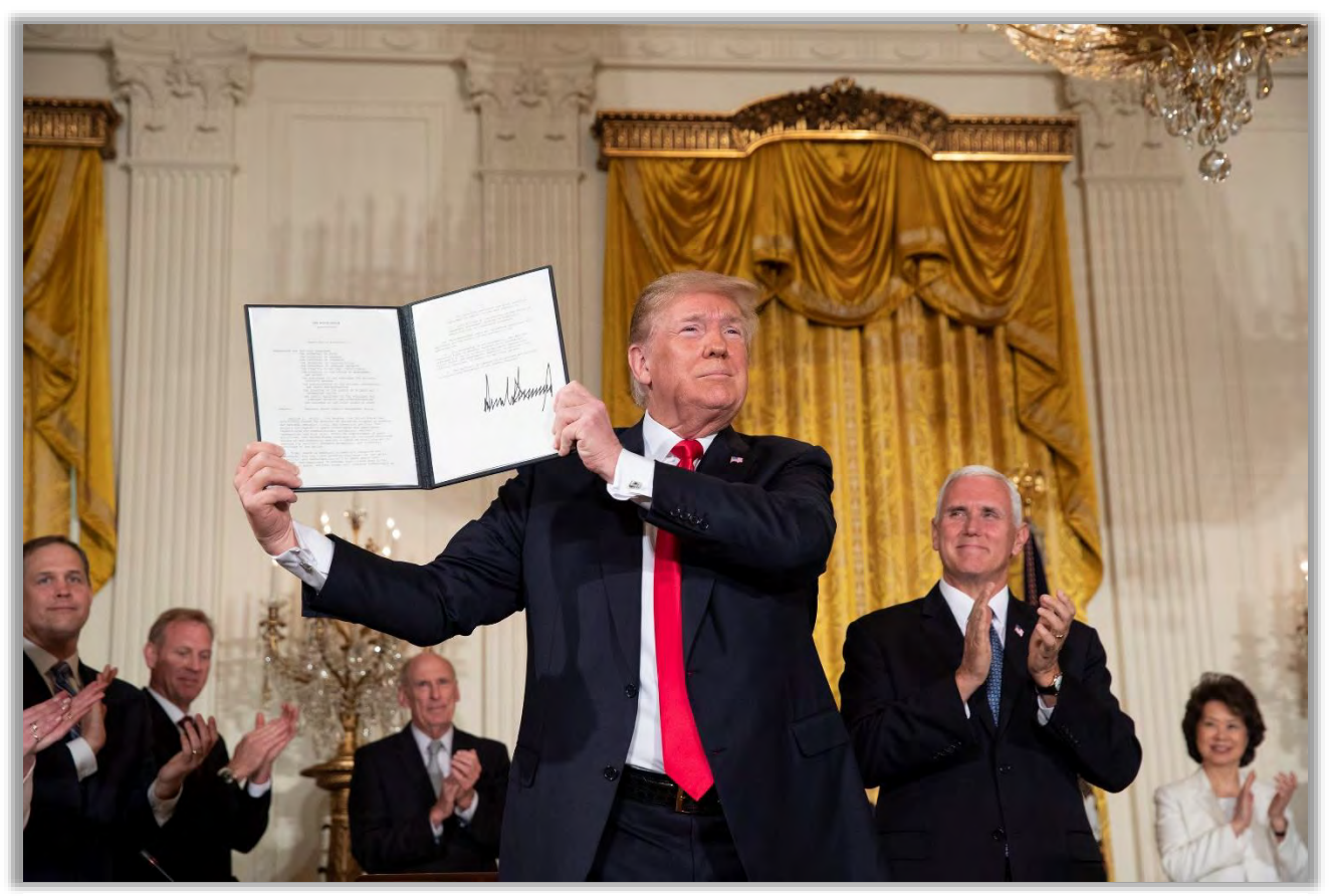
President Donald J. Trump signs Space Policy Directive 3 at the Third Meeting of the National Space Council in the East Room of the White House on June 18, 2018.

thousands. New technological advancements are not only increasing the number of American satellites, but prolonging the operational life of satellites already in orbit. Between February 25, 2020, and April 2, 2020, Northrop Grumman's Mission Extension Vehicle 1 became the first spacecraft to rendezvous with, service, and reposition another satellite to extend its useful life.