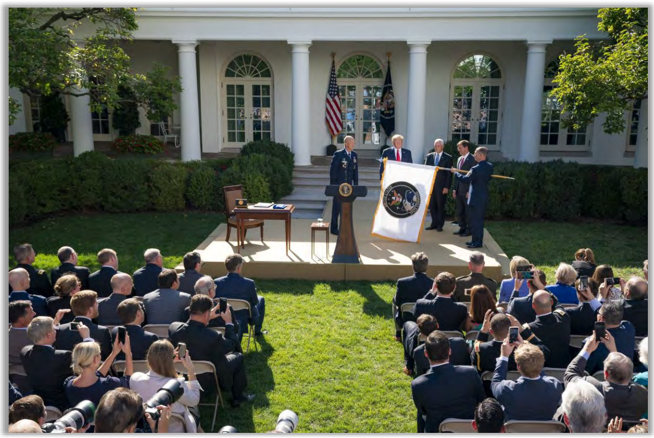
The flag of United States Space Command is unfurled during a ceremony in the Rose Garden at the White House on August 29, 2019.

The reestablishment of the United States Space Command as a Unified Combatant Command and the establishment of the United States Space Force as the sixth branch of the U.S. Armed Forces were significant efforts to effectively defend and protect American interests in all domains.