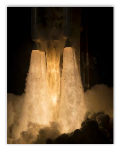
A United Launch Alliance Atlas V rocket with NASA's Mars 2020 Perseverance rover onboard launches from Cape Canaveral in Florida on Thursday, July 30, 2020.

assembly, advanced space-related power and propulsion capabilities, and orbital debris management among specific areas of interest.