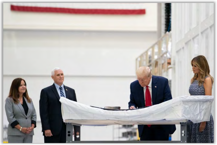
President Donald J. Trump, joined by First Lady Melania Trump, Vice President Mike Pence, and Second Lady Karen Pence, signs a panel from an Orion crew capsule during a tour of NASA's Kennedy Space Center on May 27, 2020.

In order to be sustainable over the long term, U.S. efforts must align space policies, programs, and budgets with enduring national interests that span the political divide. prosperity, national security, Economic science, and foreign policy are all inherently affected by space activities, which provide both practical and symbolic benefits for the United States. The Trump Administration has prioritized national interests in the space domain in concert with core American values: democracy, freedom, the rule of law, and free markets. To advance U.S. national space power and make the world safer and more prosperous, American values must thrive on the next great frontier.