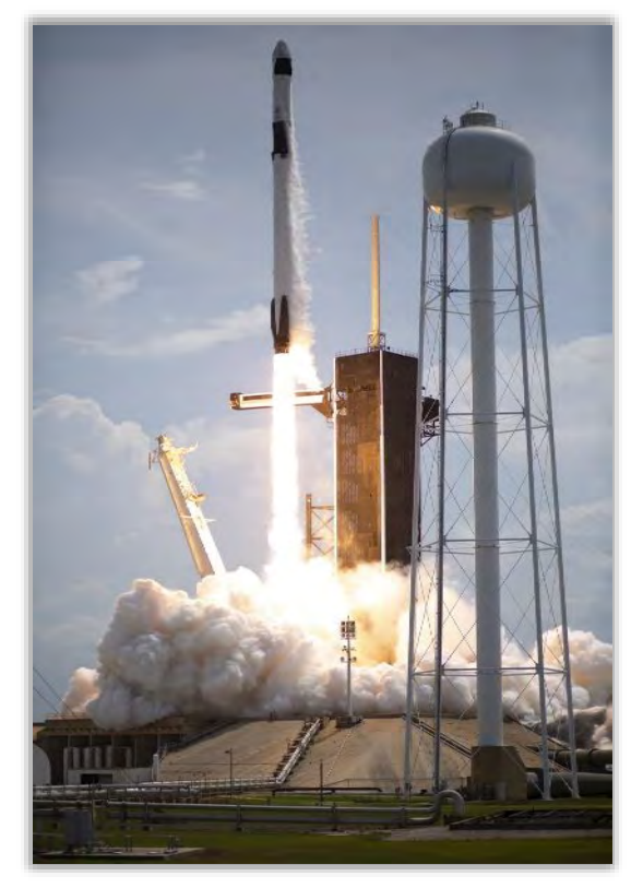
A SpaceX Falcon 9 rocket is launched from Launch Complex 39A for NASA's SpaceX Demo-2 mission to the International Space Station with NASA astronauts Robert Behnken and Douglas Hurley aboard at NASA's Kennedy Space Center on Saturday, May 30, 2020.

extension of U.S. presence from low-Earth orbit, a return to the Moon for a sustainable presence, and missions to Mars and beyond. The report lays out necessary steps to achieve a truly American future in space, recognizing that it is not merely American machines and astronauts that constitute U.S. space activities, but American values as well.