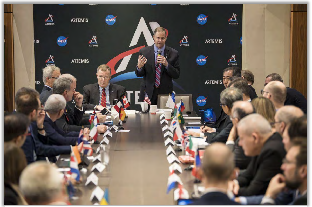
NASA Administrator Jim Bridenstine speaks with the heads of international space agencies at the 2019 International Astronautical Congress in Washington, D.C.

On July 27, 2020, officials from the Departments of State, Defense, and Energy, as well as the National Security Council, met with Russian Federation officials in Vienna, Austria, for a Space Security Exchange under the framework of the Strategic Security Dialogue, the first of its kind in seven years.