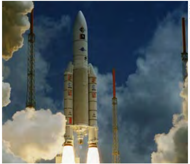
Launch of an Ariane 5 Rocket

However, it is crucial to provide comprehensive protection for the command & control ground facilities of our space assets, since those facilities already are and will remain the weakest link of our space systems. Indeed, any nation, or even any terrorist group, can easily destroy such facilities, whereas attacking in-orbit assets requires technical resources that are more difficult to obtain.