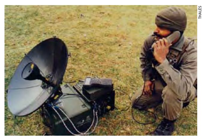
Spartacus, the Syracuse portable terminal

• funding the development of technologies specific to defence requirements (cryptography, anti-jamming, etc) and, if need be, building technology demonstrators in that field: