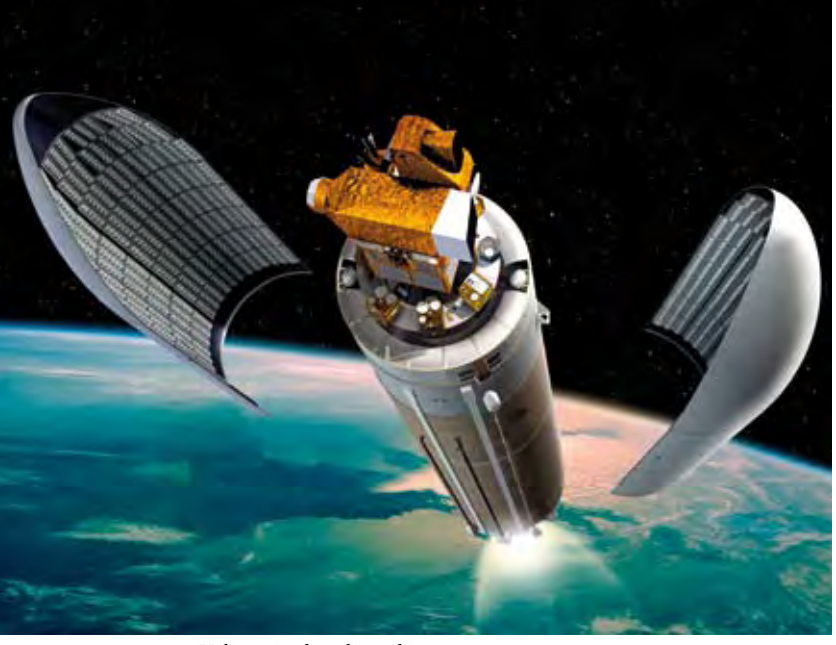
Helios 2 is placed in orbit