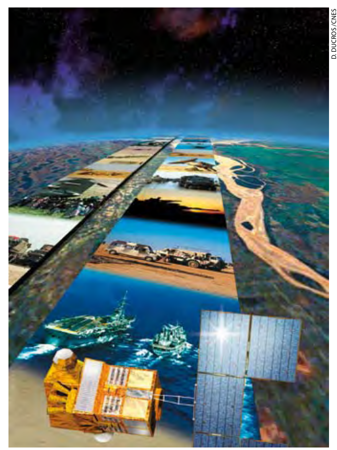
Artistic illustration of Helios military satellite