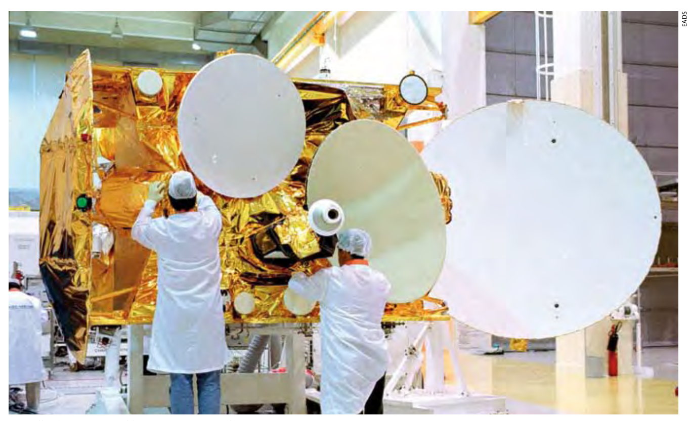
A satellite being integrated by Matra Marconi technicians EADS-Astrium

European governments have a significant role to play in retaining skills and developing a strong, competitive industrial base.