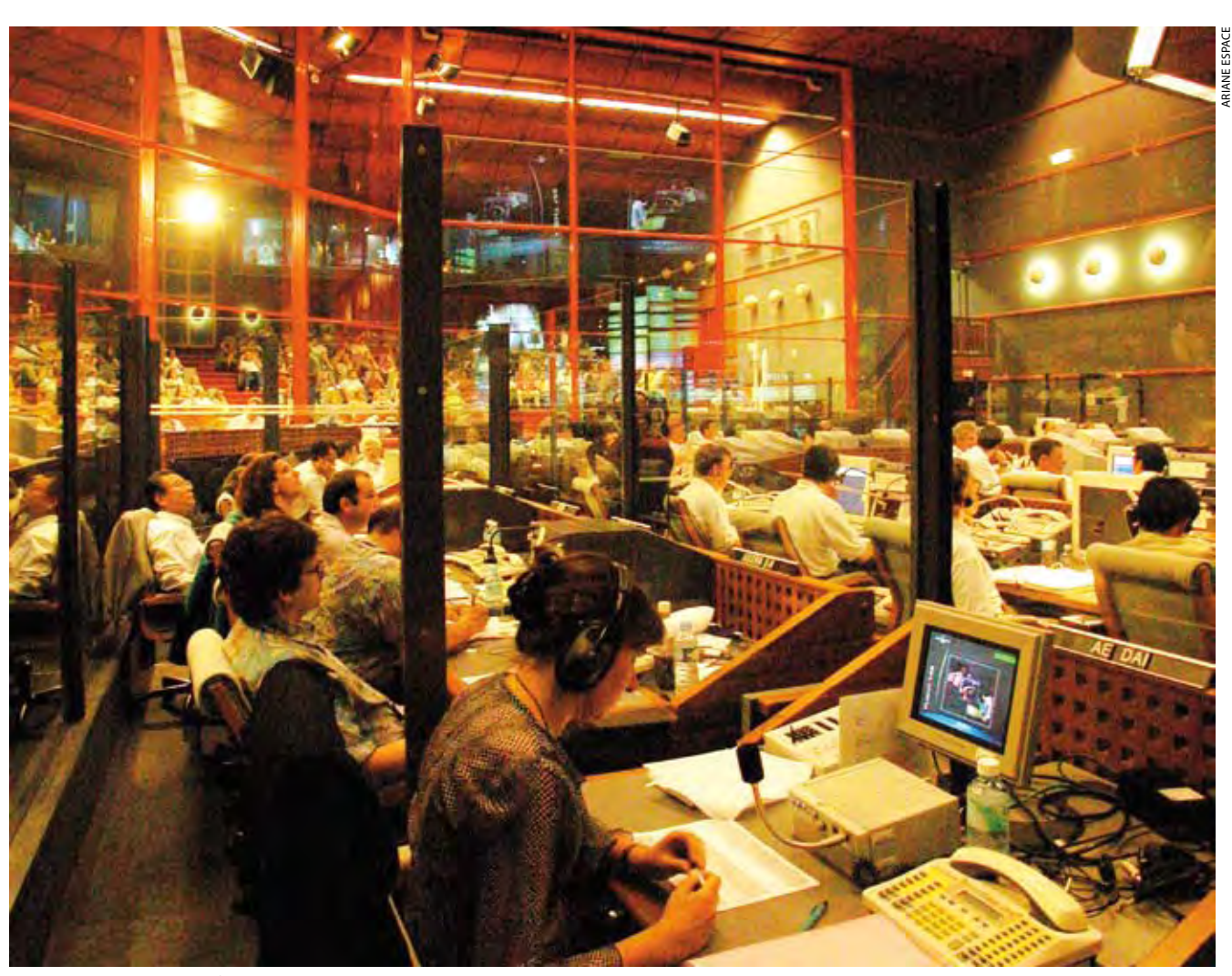
Kourou Spaceport Control Centre, Guiana

Such an approach is not only likely to sustain and enhance the capabilities that are already available to the French armed forces in Europe, but also to supplement these capabilities to provide Europe and France with the means to achieve a policy that matches the strategic challenges of the 21st century.